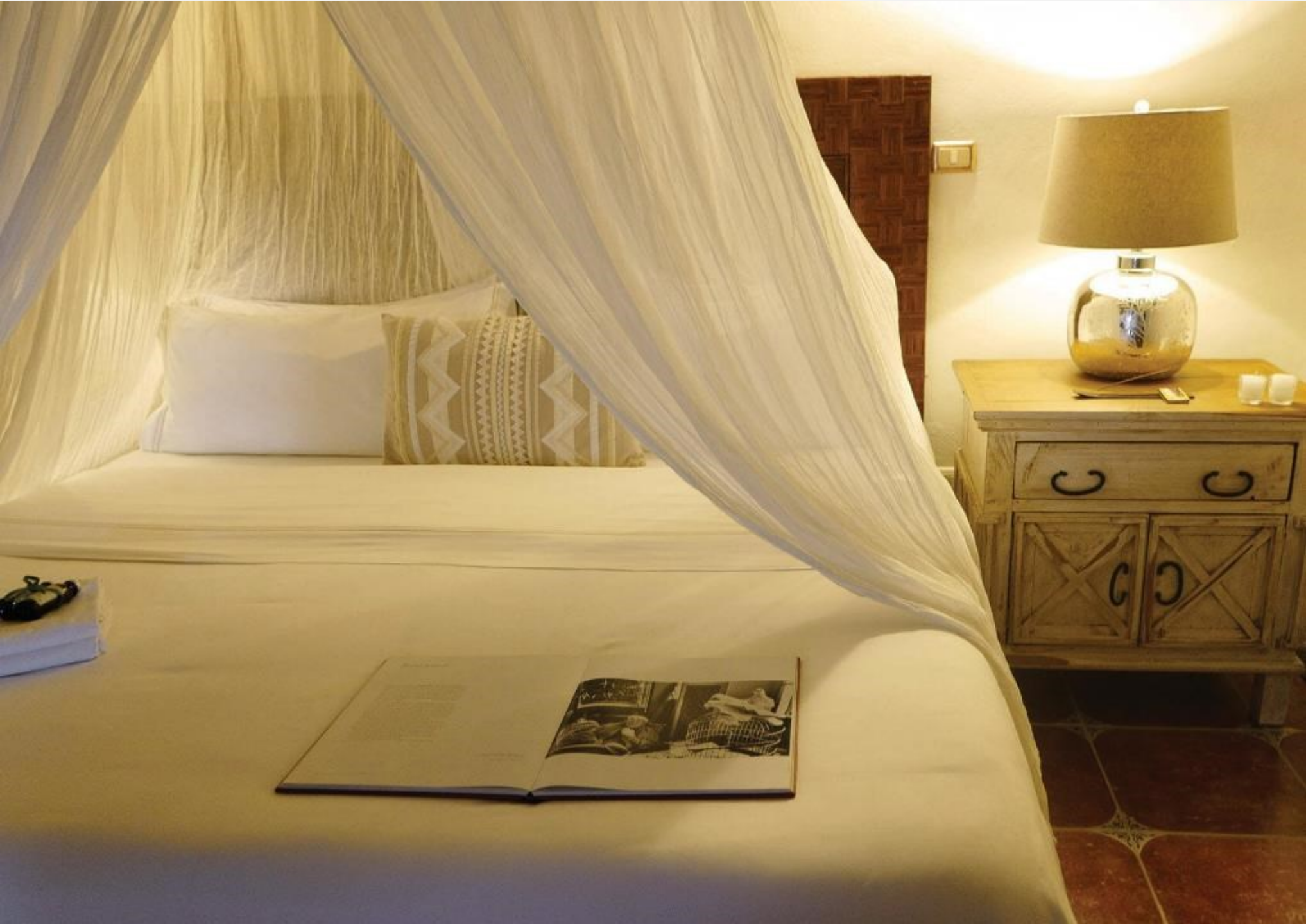
Room & Suites