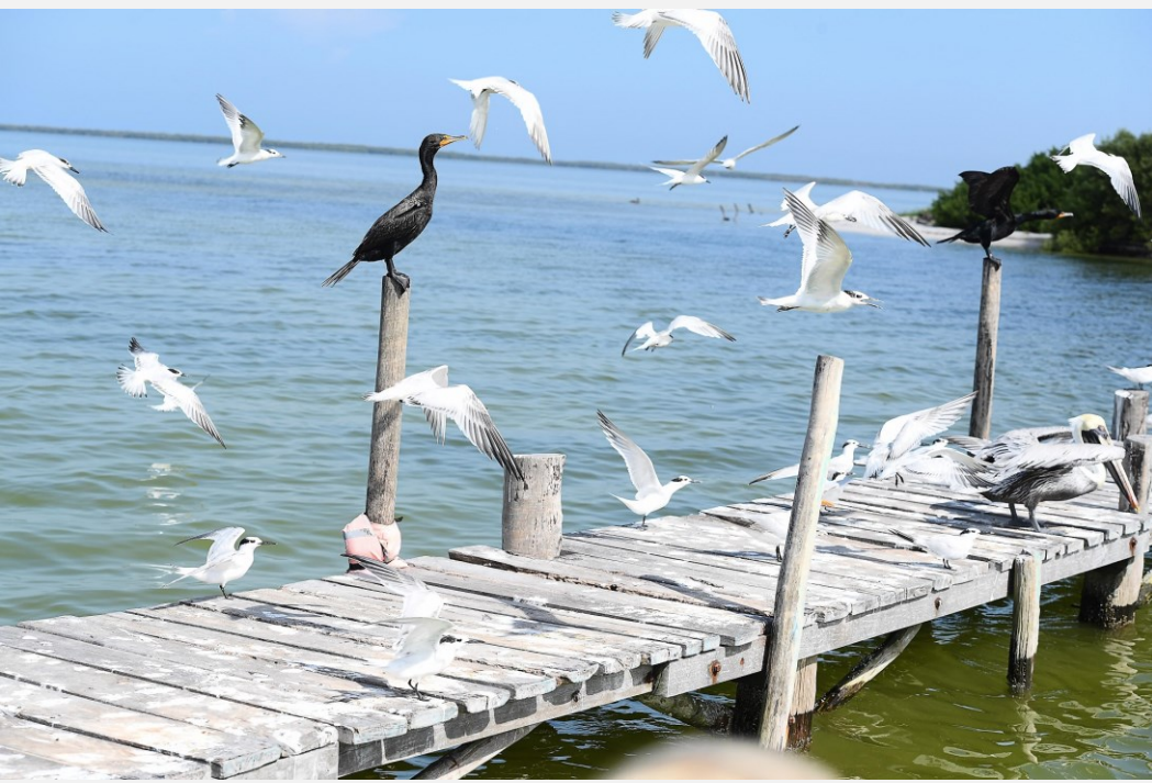
Island of birds and Passion Island