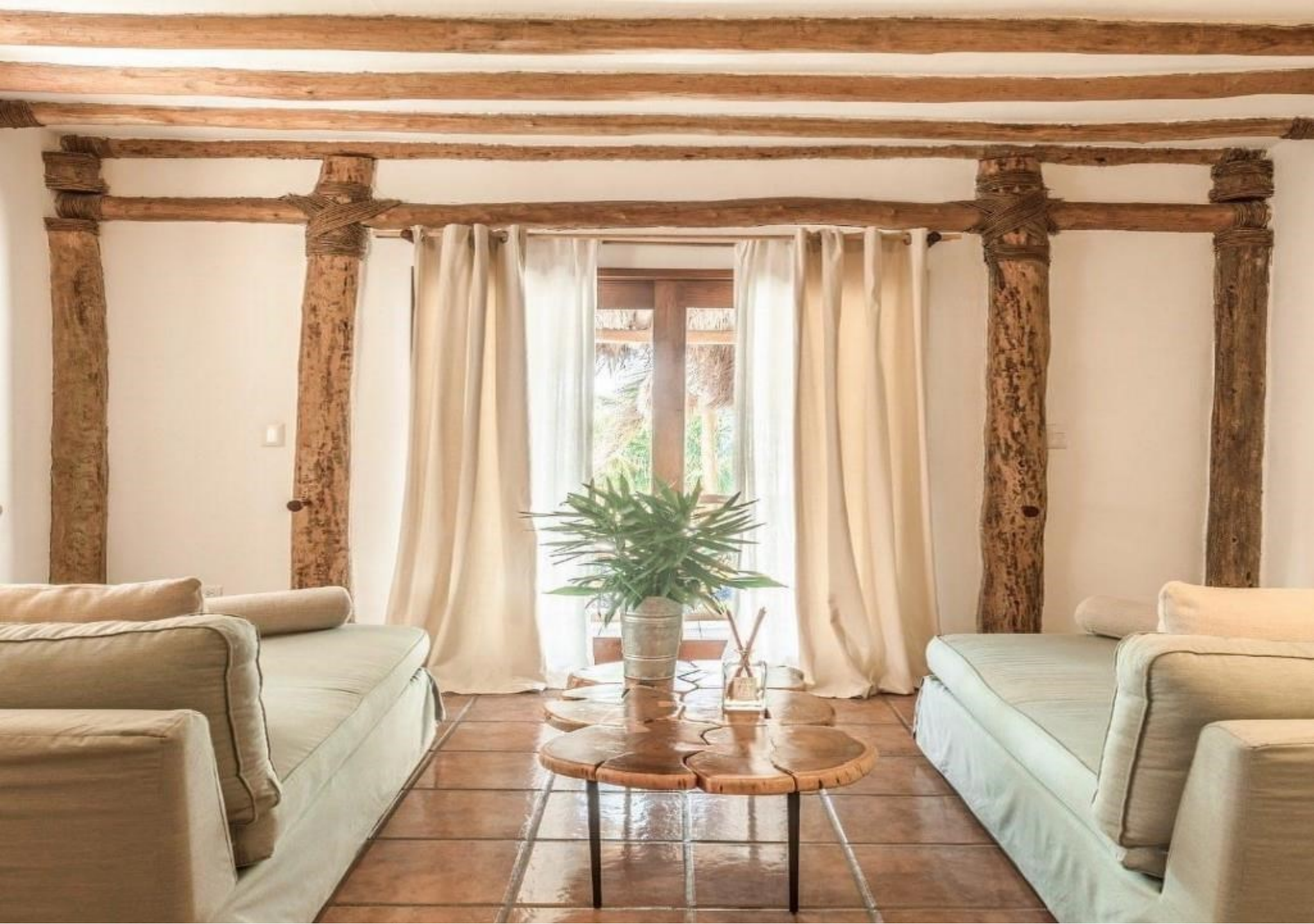
Room & Suites