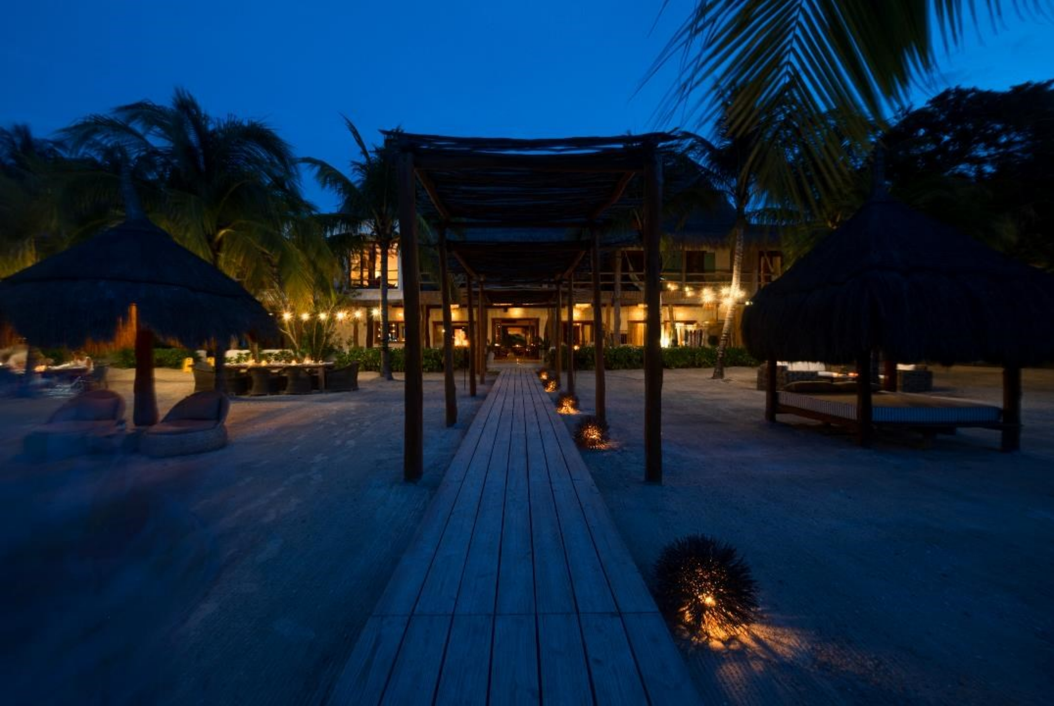
View from the beach at night