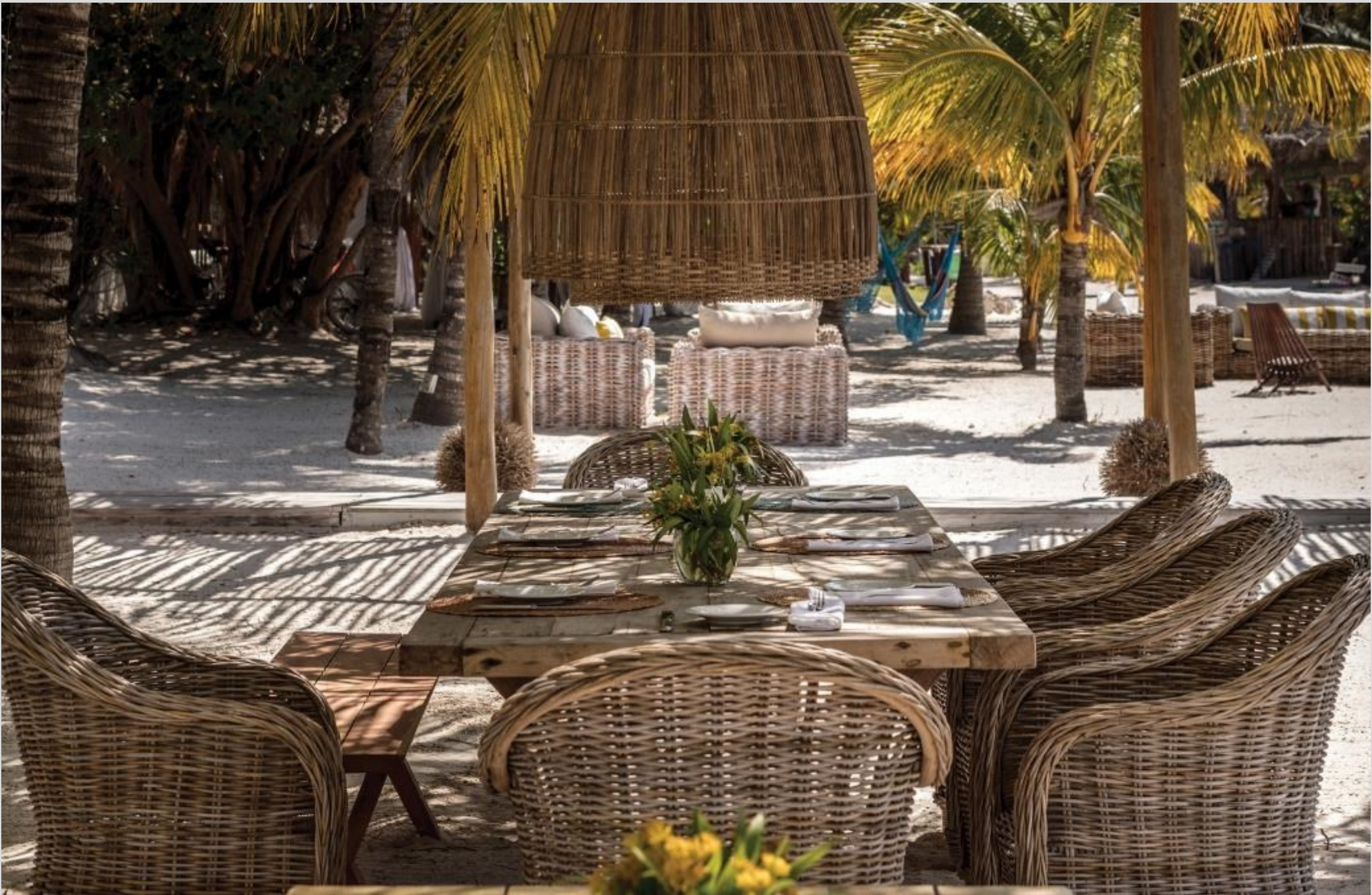
Ser Esencia Restaurant