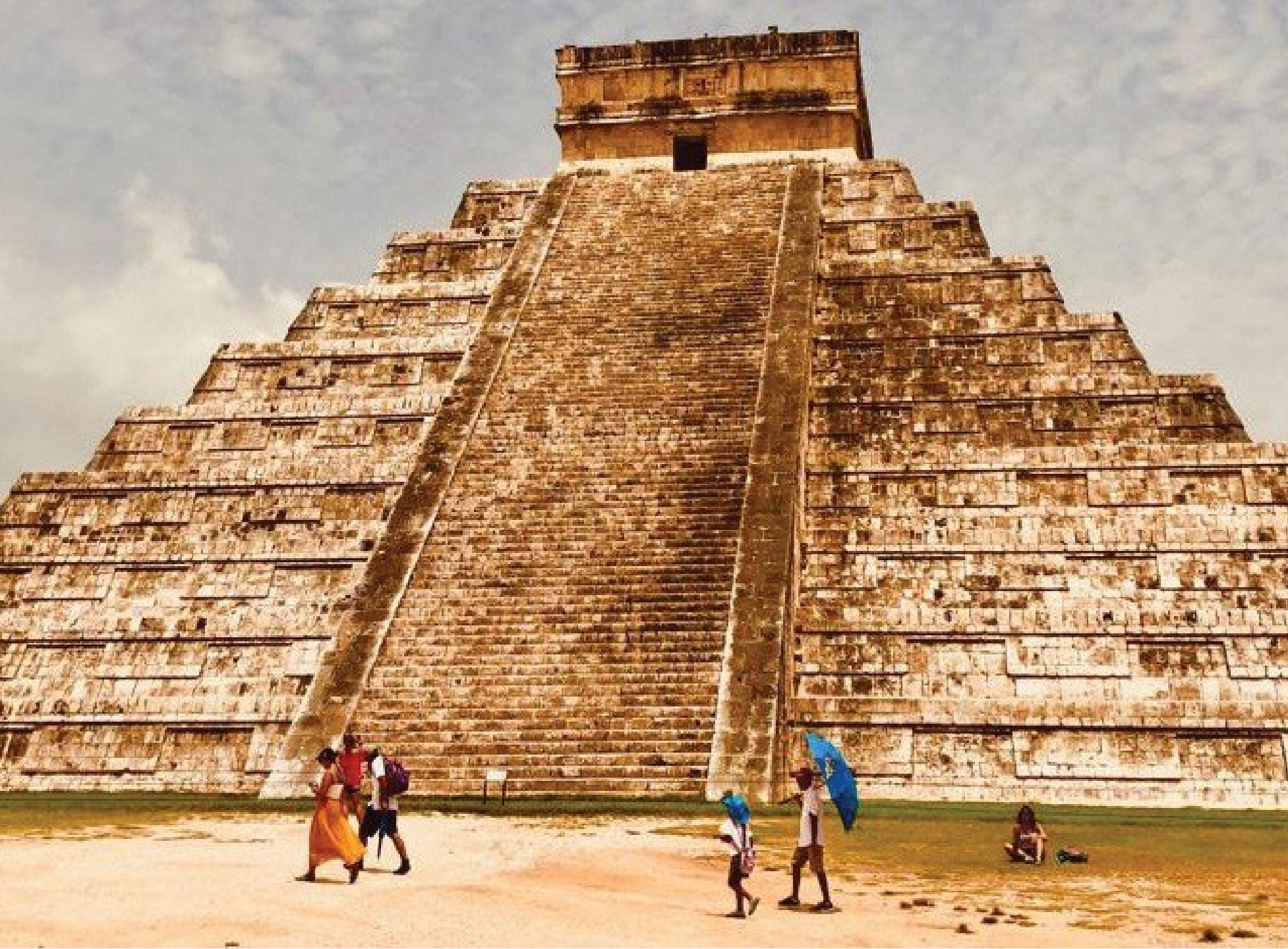
Excursion to Chichén itzá