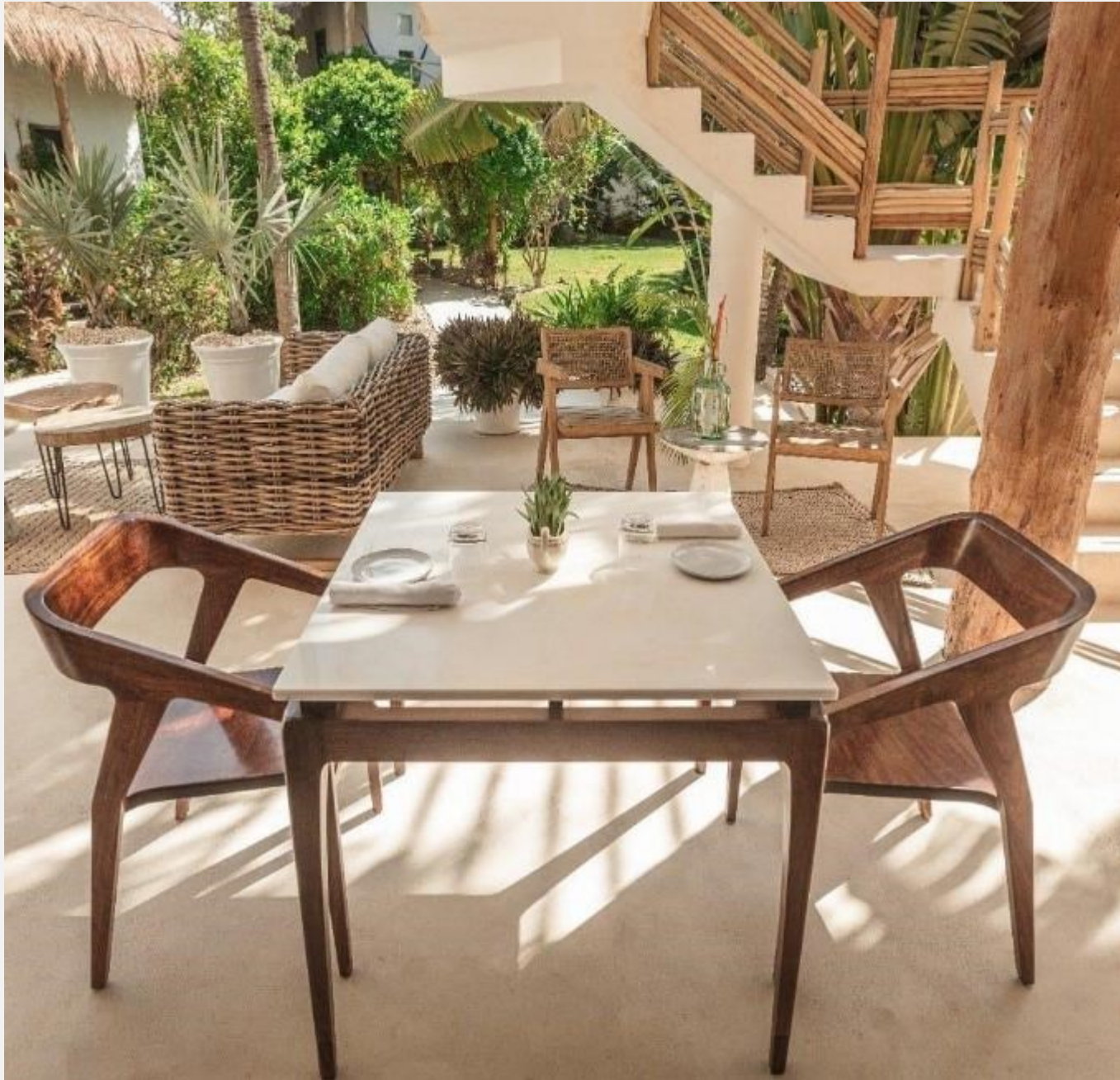
Ser Esencia Restaurant