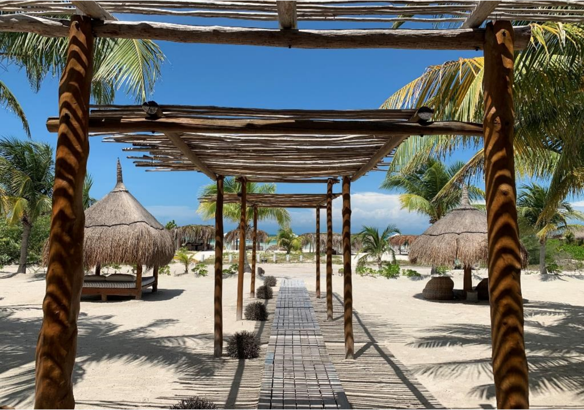
View from the entrance to the beach