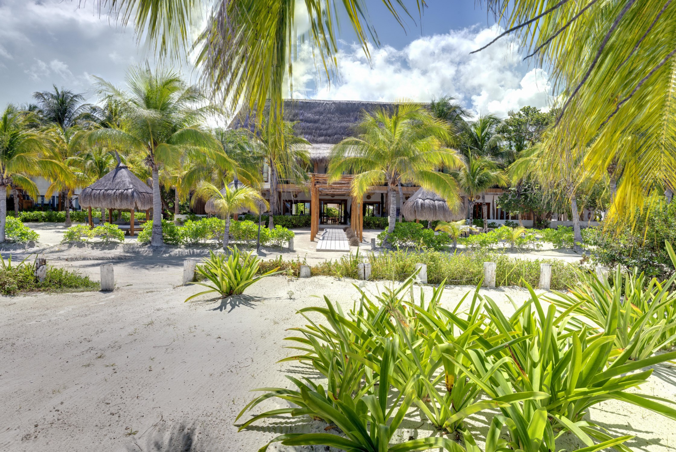
View from the beach day time