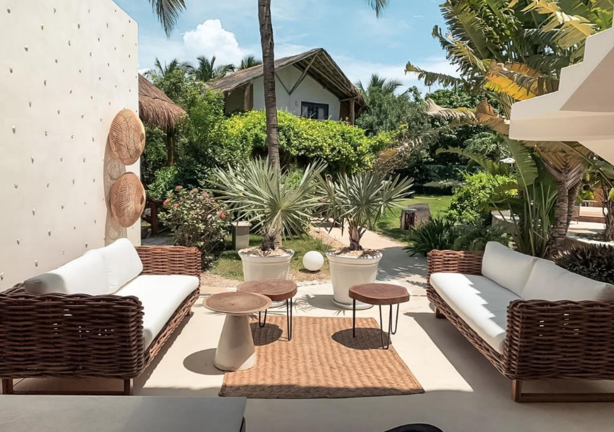
Outdoor sitting room