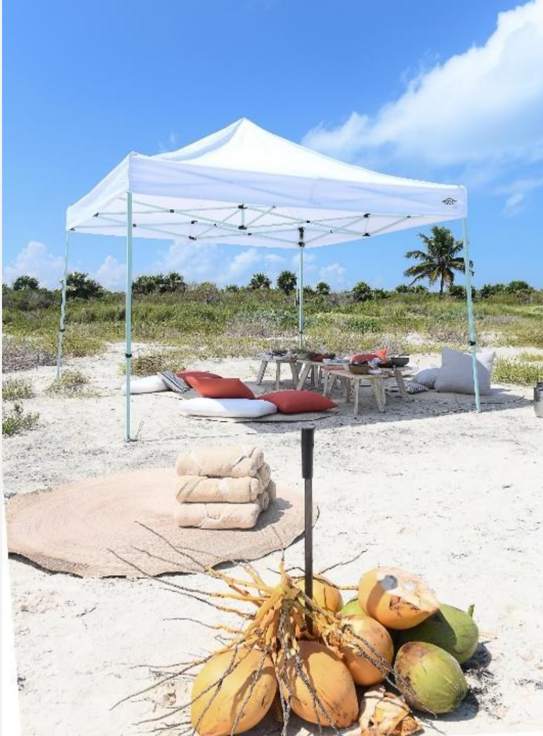
Private Beach Pic Nic