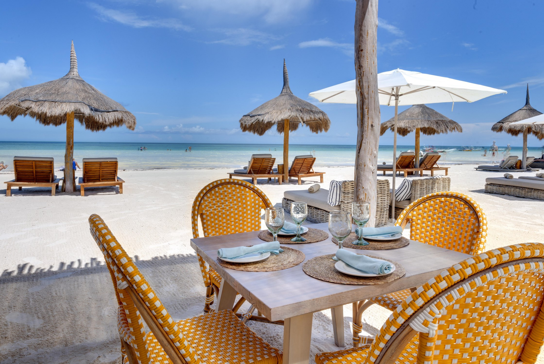
Mojito Beach Bar & Restaurant