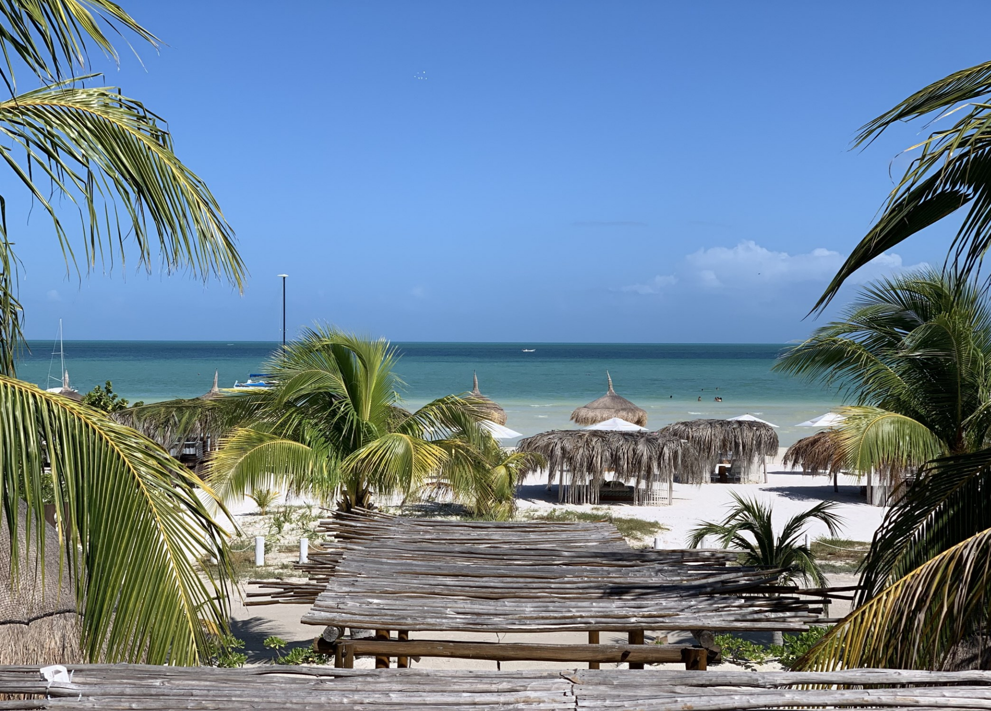
Ocean view from some of the suites of the main building